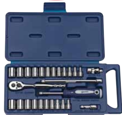
50672 List Price $ 64.53