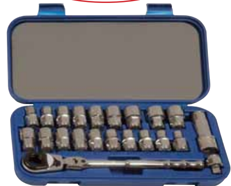
50671 List Price $ 197.76