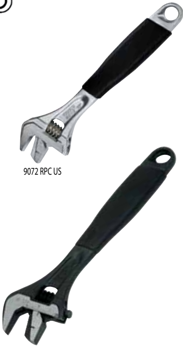
9072 RP US