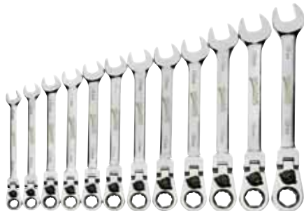
MWS-12RCF List Price $ 321.80