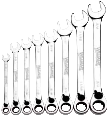
WS-1168RC List Price $ 186.25