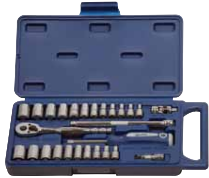
50661 List Price $ 64.53