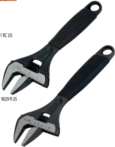
9029 R US