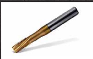
Extended Tool Life (2X or better!)