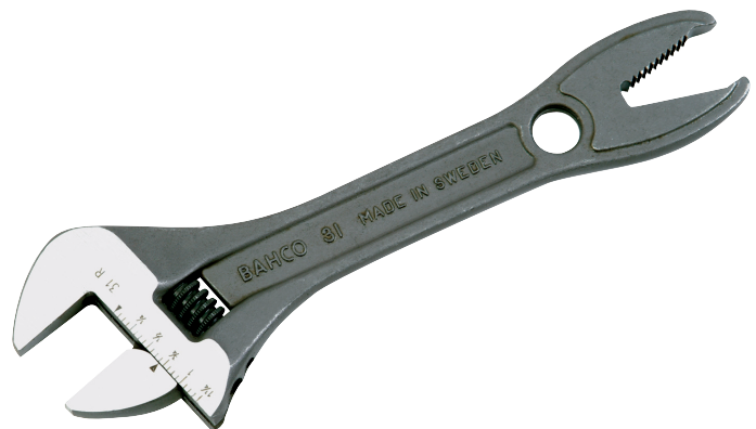
31 R US