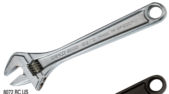
8072 RC US