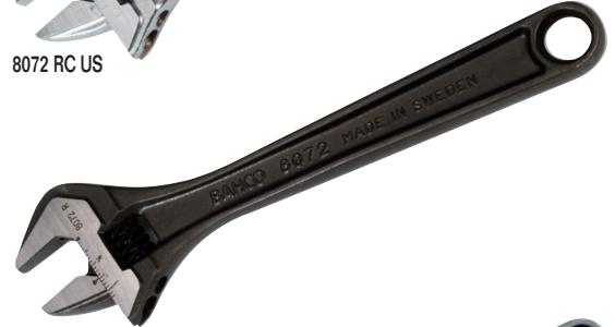
8072 R US