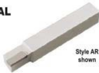
Style AR shown