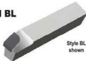
Style BL shown